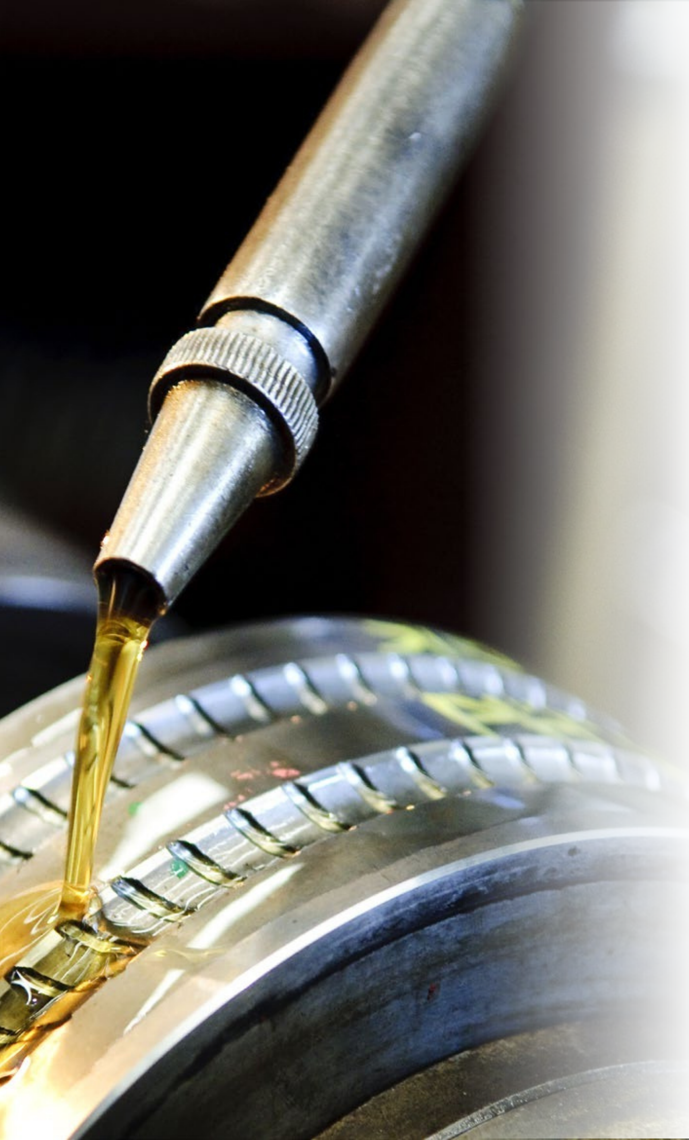
ADCO Lubricants | Product Catalog